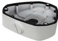
DS-1281ZJ-DM25 Inclined Ceiling Mount