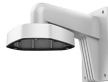
DS-1273ZJ-DM25 Wall Mount