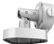
DS-1283ZJ Wall Mount (3-axis Adjustment)